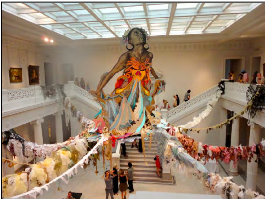
FIGURE 5b: Swoon, Thalassa , mixed media, site-specific installation, 20 feet tall, New Orleans Museum of Art, 2011.