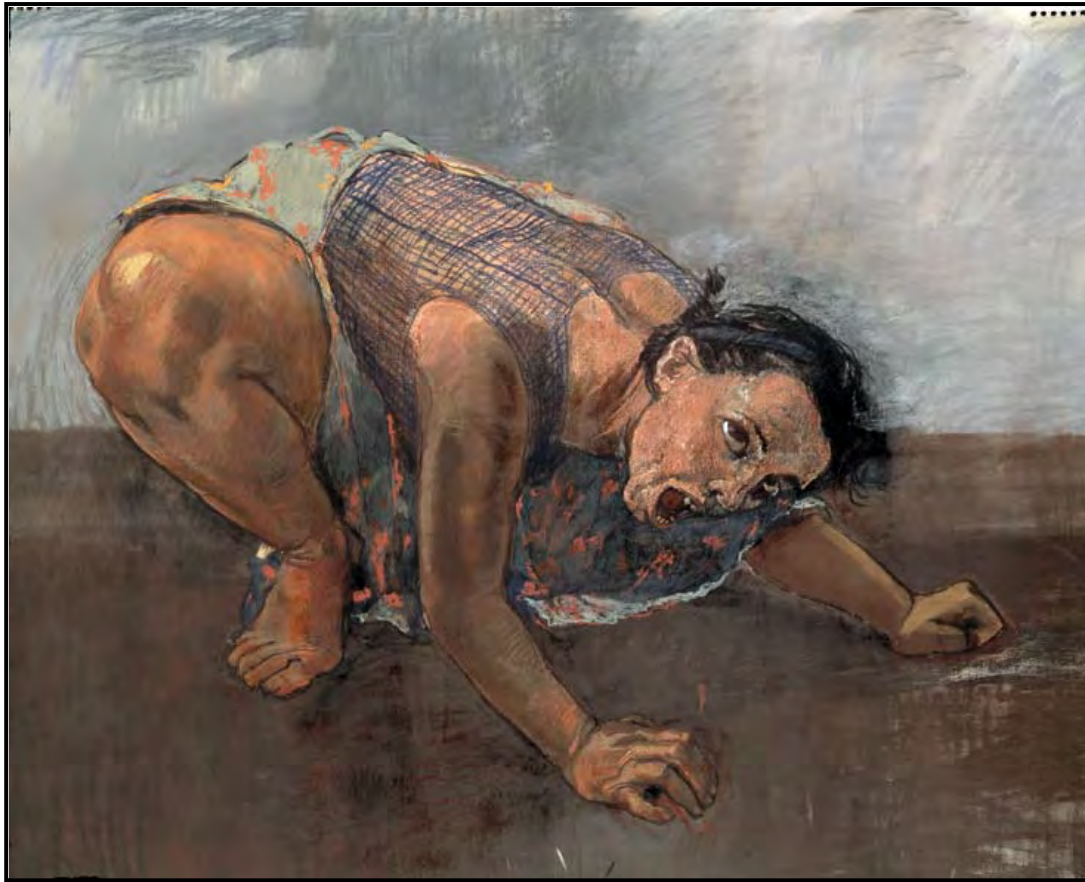
FIGURE 3a: Paula Rego, Dog Women , pastel on paper, 1994.