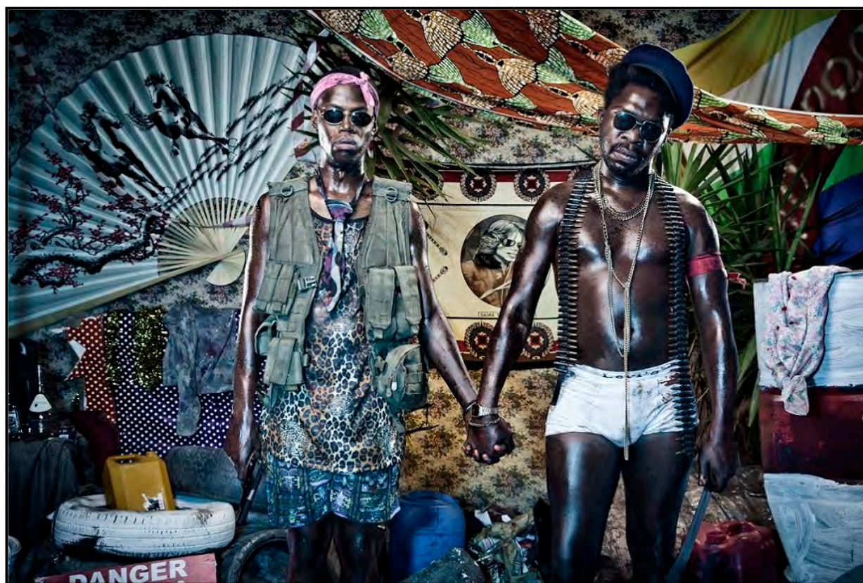
FIGURE 7b: Kudzanai Chiurai, Untitled III , photomontage, ultrachrome ink on photo fibre paper, 2011.