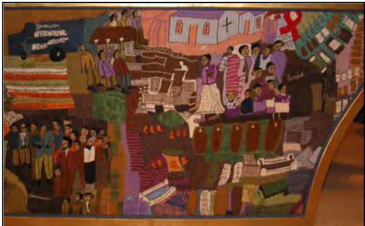
FIGURE 4b: The Keiskamma Project: Altarpiece, the Crucifixion – Transcending AIDS in South Africa (detail) , tapestry on wood panels, 2006.