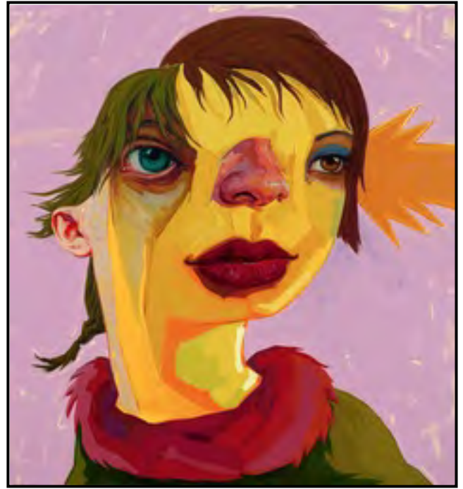
FIGURE 6b: Yi Chen, The Abnormal Icon , oil on canvas, 2012.