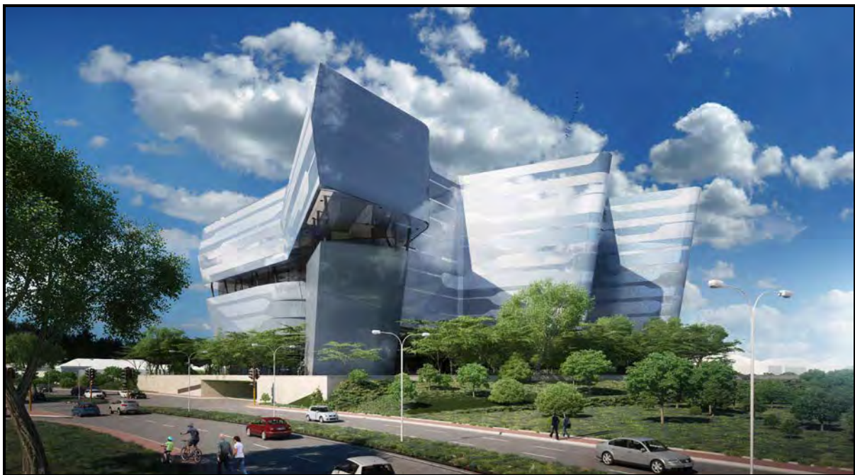
FIGURE 8b: Paragon Architects, Design for the Sasol Corporate Building , Sandton, (opening in 2016).