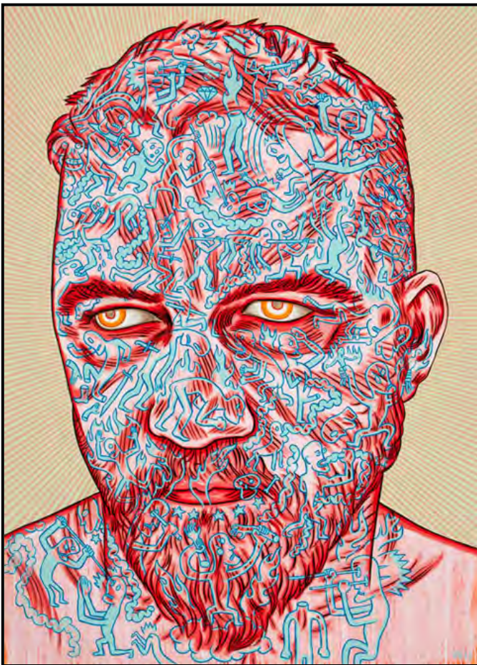
FIGURE 6c: Conrad Botes, The Temptation to Exist IV , acrylic on canvas, 2011.