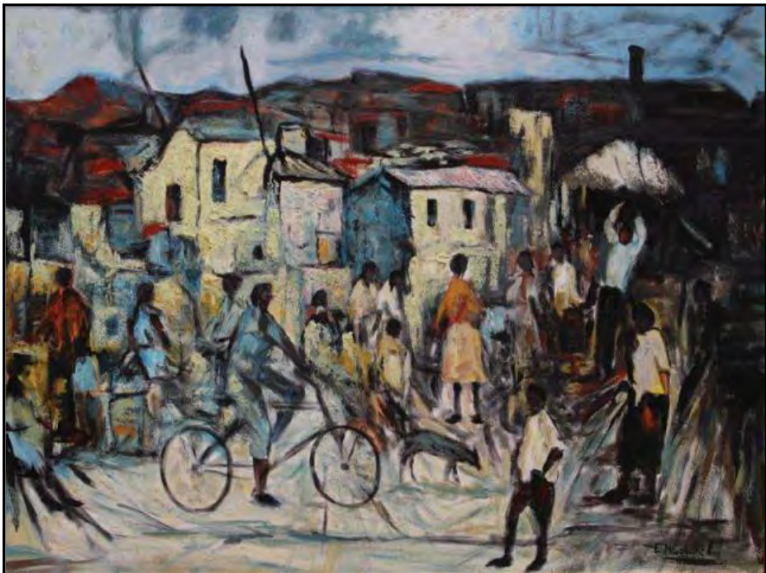
FIGURE 1b: Ephraim Ngatane, Township Scene with Dog and Bicycle , oil on board, date unknown.