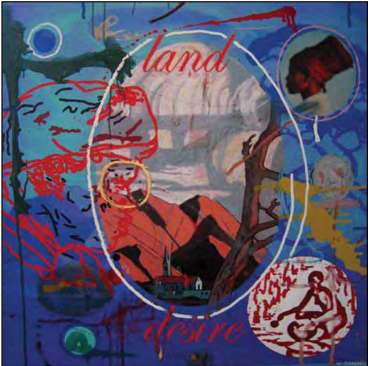
FIGURE 2a: Wayne Baker, Land and Desire , strung glass beads, 2009.