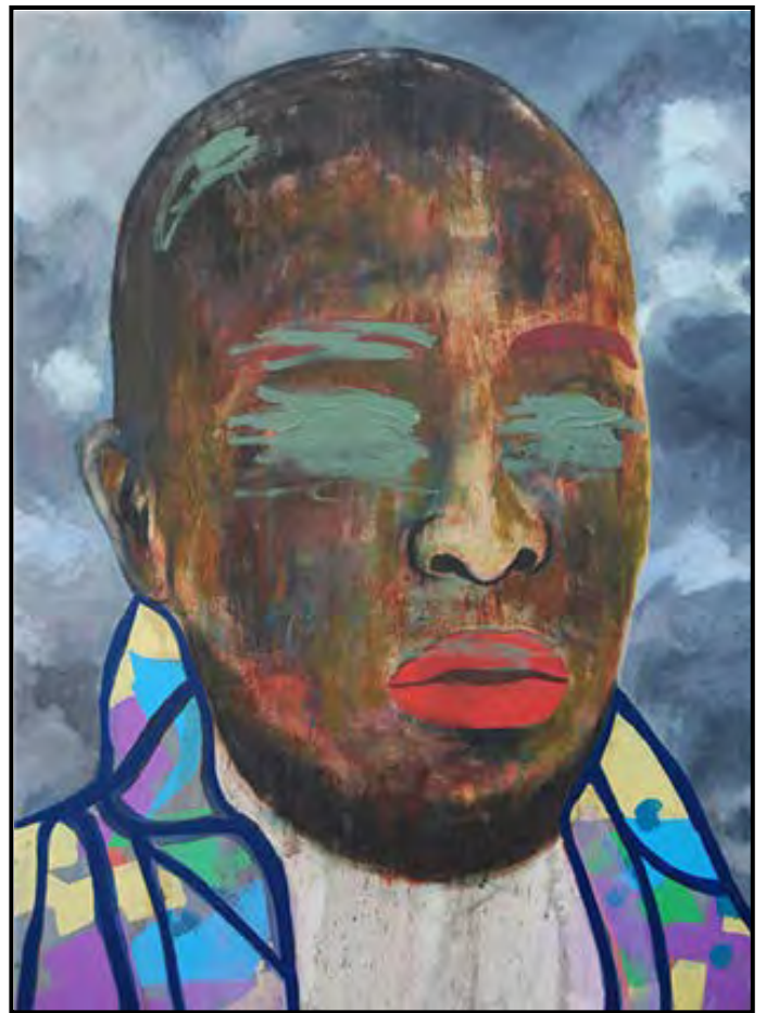
FIGURE 6d: Mustafa Maluka, Why Do You Tear Me from Myself? , oil on canvas, 2009.