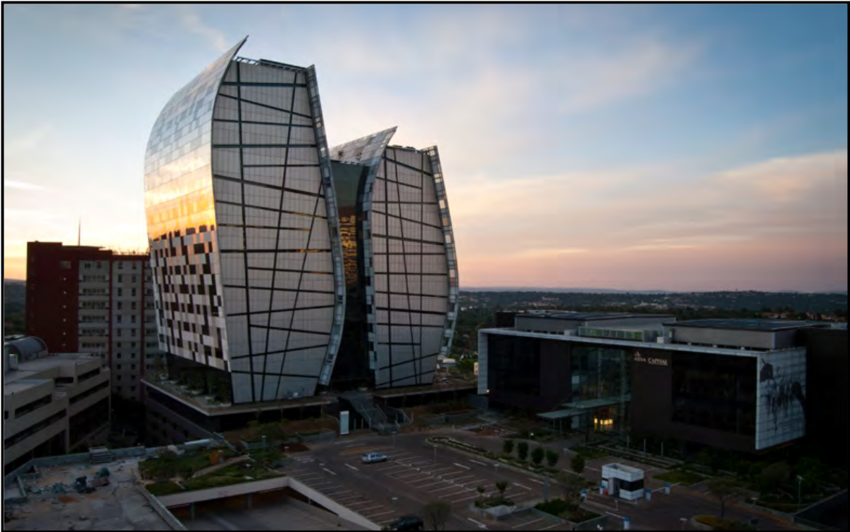
FIGURE 8a: Paragon Architects, Norton Rose Towers , Sandton, 2011.