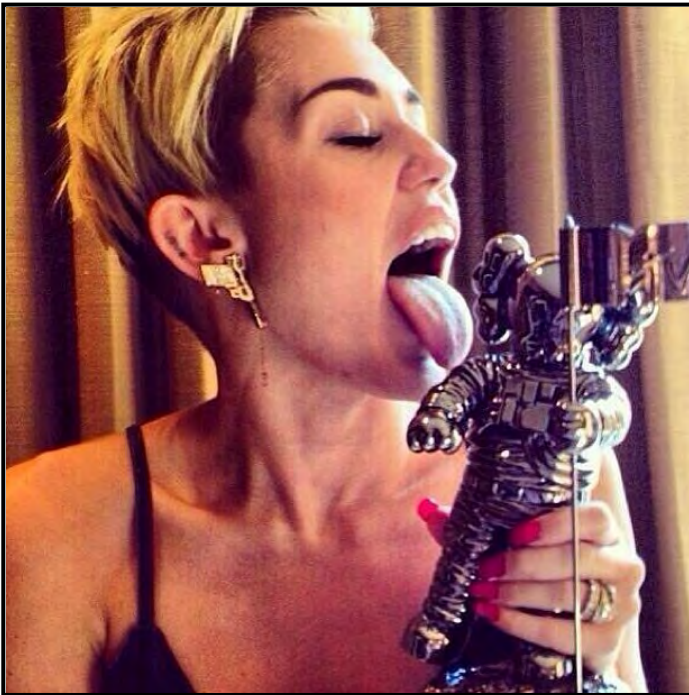
FIGURE 6a: Mylie Cyrus, Selfie , Instagram, 2013.