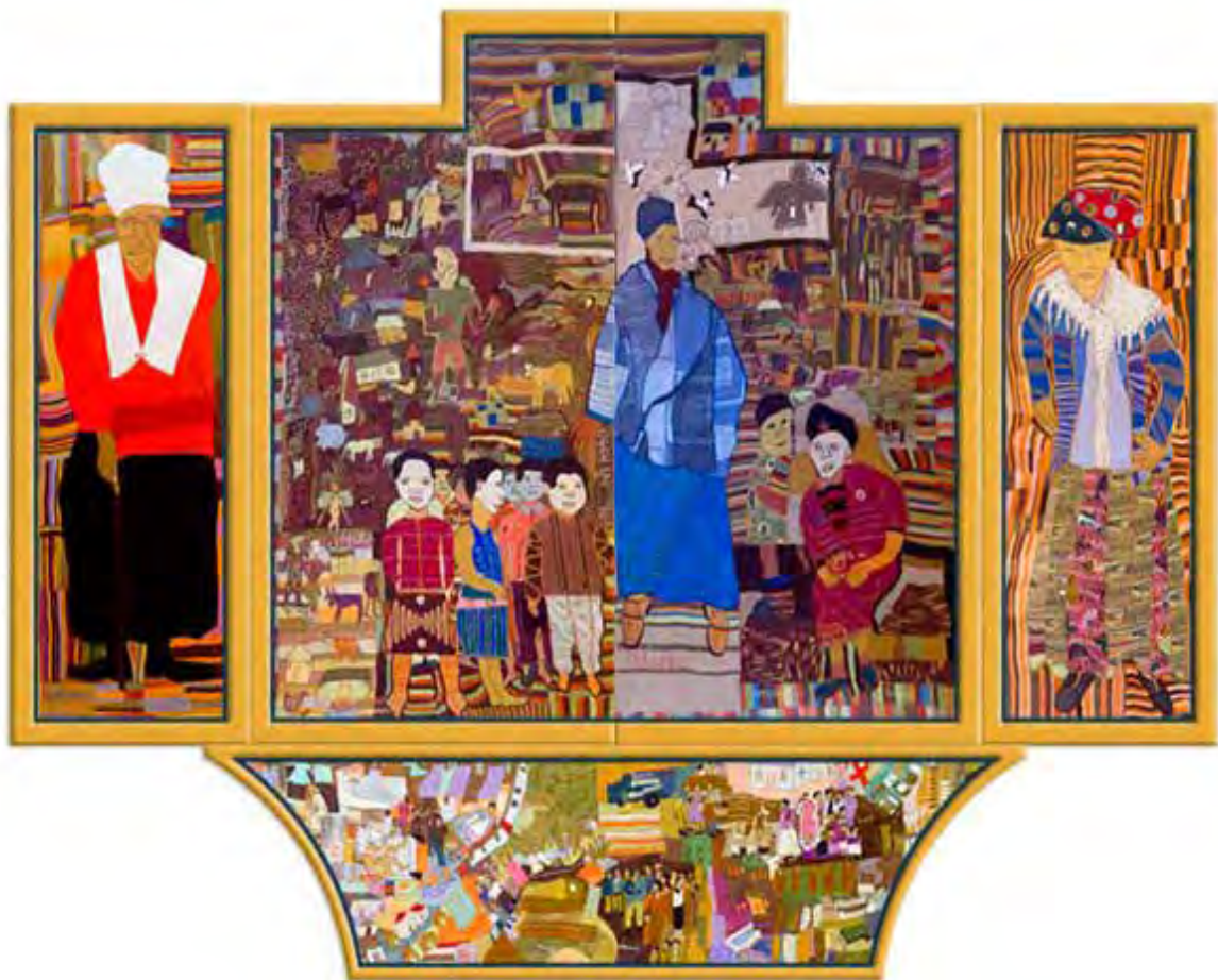
FIGURE 4a: The Keiskamma Project: Altarpiece, the Crucifixion – Transcending AIDS in South Africa , tapestry on wood panels, 2006.