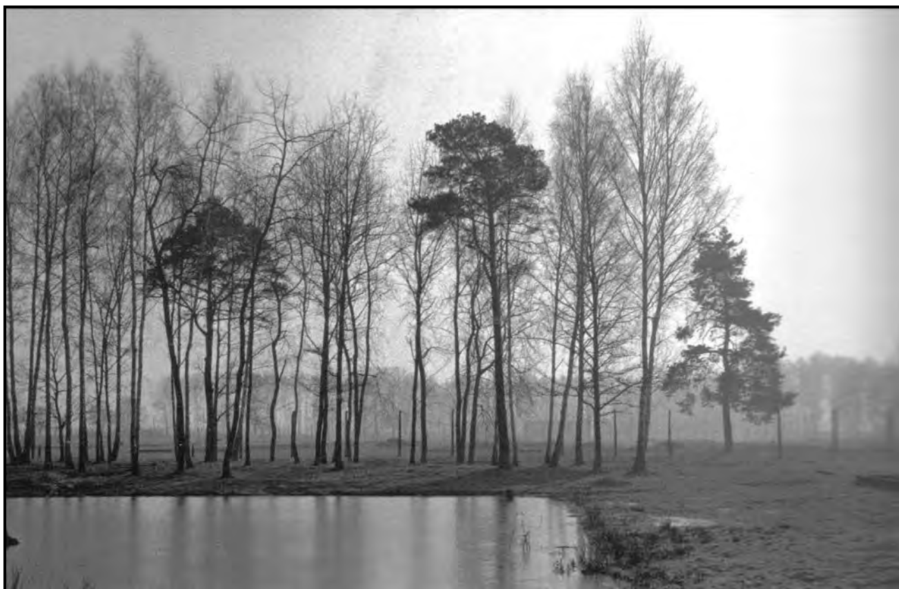
FIGURE 4: Santu Mofokeng, Birkenau – KZ2, Poland , photo, 1997–1998. The lake where the ashes of Jews were dumped.