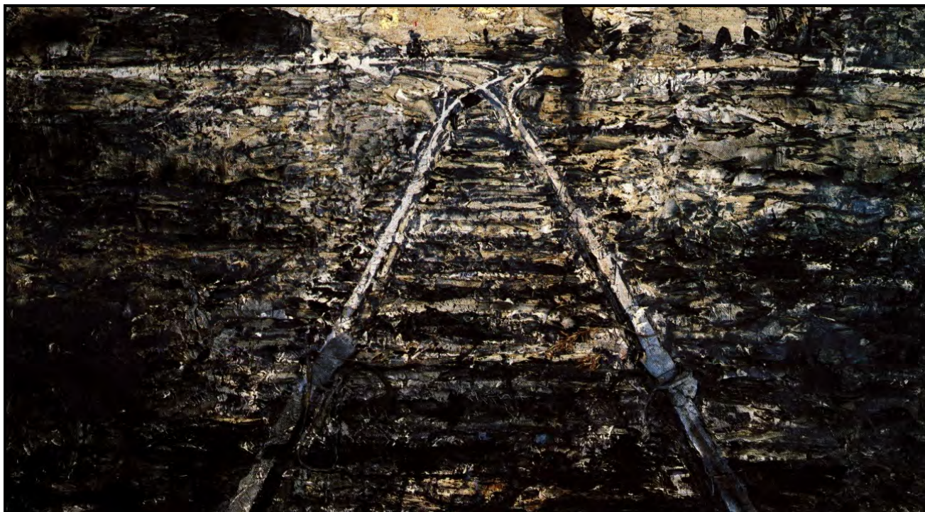
FIGURE 3: Anselm Kiefer, Iron Road , oil, acrylic, metal and lead, olive branches, iron and lead, 1986. The railway lines leading to the German concentration camps.

Landscape is the mute witness to histories and narratives.