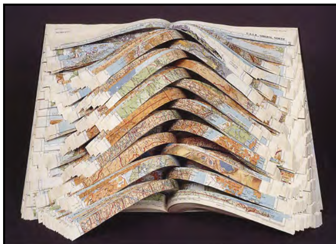
FIGURE 9: Doug Beub, Fault lines , altered atlas paper, 2003.