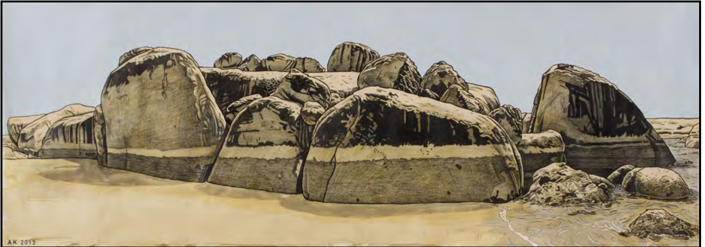
FIGURE 2: Anton Kannemeyer, Boulders Beach, Simon's Town , pencil, black ink and acrylic, 2013.