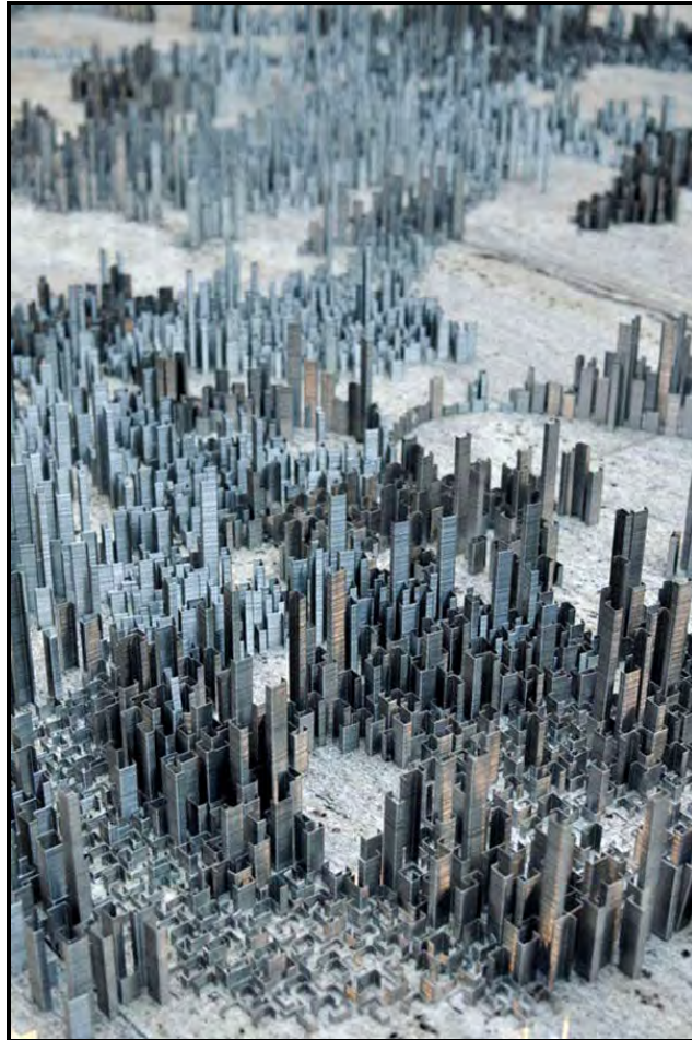
FIGURE 8: Peter Root, Ephemicropolis , city of staples art, installation consisting of 100 000 staples, 2012.

So, is an urban landscape simply a landscape of a city? Or is it more than that?