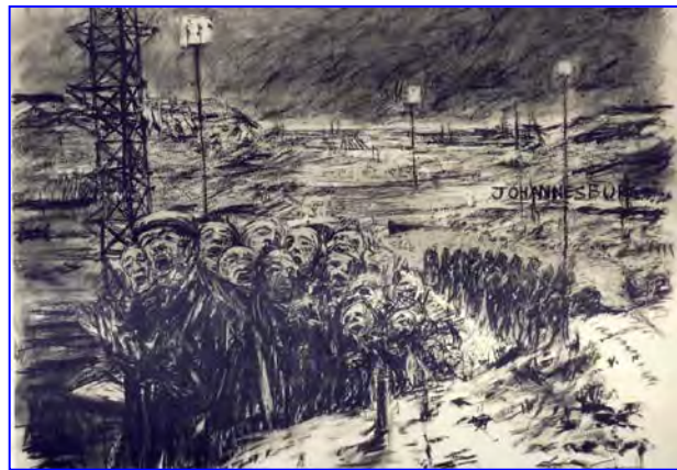
FIGURE 7: William Kentridge, Johannesburg, 2 nd Greatest City after Paris , charcoal drawing, 1989.

Dreams are our only geography – our native land.