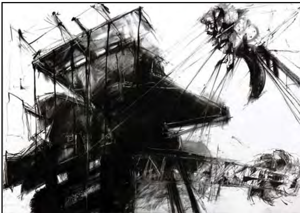
FIGURE 5: Jeannette Unite, Residuum Mine Machines & Residues of Power , monumental drawing on cotton fibre paper in etching, charcoal, artist-made pastels that incorporate goldmine dust, metal oxides and mine dump tailings, 2012.

Africa the motherland NATION Africa the land of my forefather Africa the land of my great ancestor once roamed Africa the land of many communities Africa the land of my birthplace Africa the second largest continent on EARTH Africa the land which everybody imitates Africa the land which everyone talks about Africa the land which everyone is jealous about Africa the land that brings beauty in all of us Africa the land of great leadership Africa the land of great powers Africa the land of bright futures Africa the land of great traditions Africa the land of good food Africa the land of vast populations Africa the land of real precious diamonds Africa the land of UNITY Africa the land of hard working people Africa the land that lord gave to us Africa the land that I love Africa the land that I will SOON return to – Obi Onyenwe