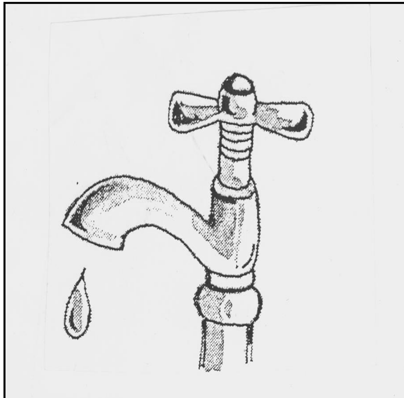
[Sicashunwe ku- www.draught.com ]