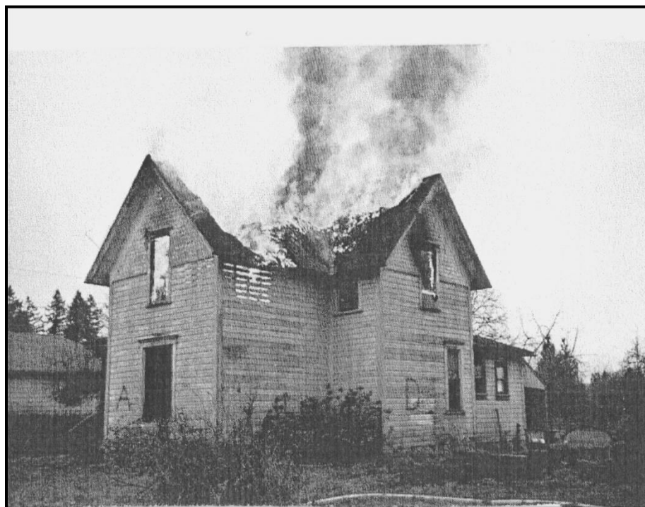
[Sicashunwe ku- www.disaster.com ]